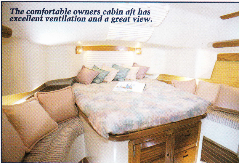
The comfortable owners cabin aft has excellent ventilation and a great view.