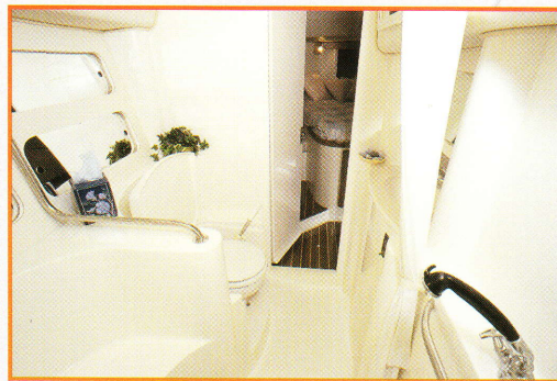
The aft head