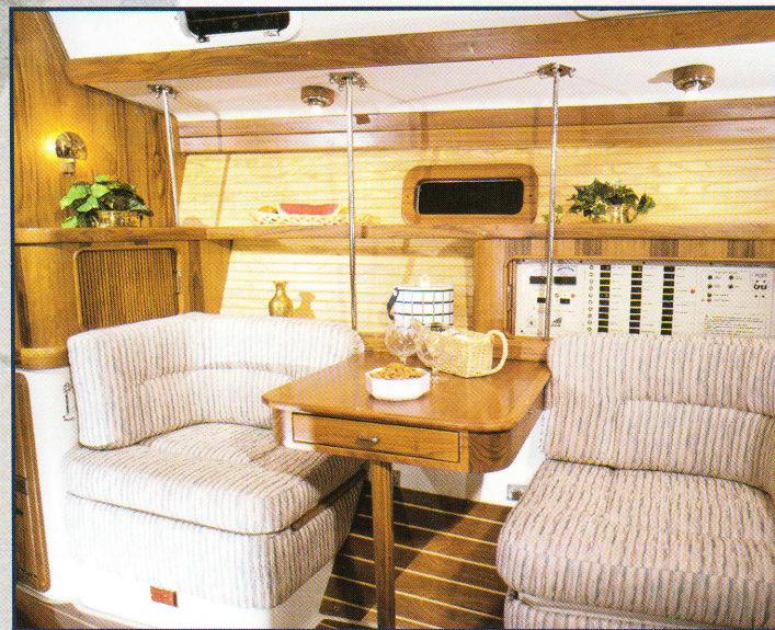
The starboard dinette also makes a settee or berth when the table is lowered.