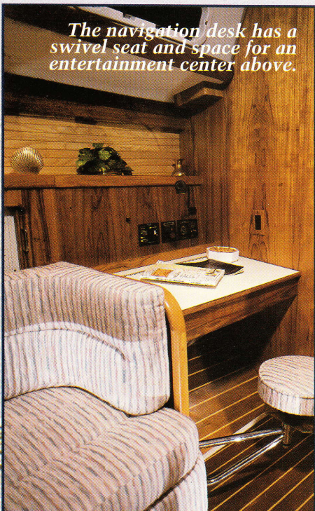
The navigation desk has a swivel seat and space for an entertainment center above.