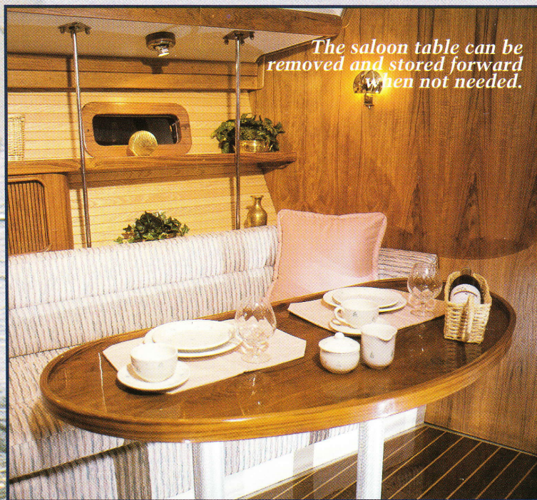
The saloon table can be removed and stored forward when not needed.