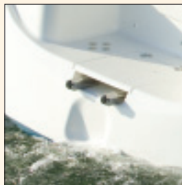
The generous stern boarding area has seats port & starboard, and a concealed boarding ladder that can be deployed from the water for safety.