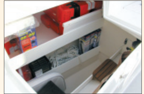
The cockpit locker to starboard is truly cavernous; it is fitted with shelves big enough for bikes or inflatable dinghy.