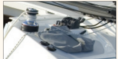
All sail controls are led aft. A Harken electric mainsheet/halyard/furling winch is available. Ball-bearing deck organizers, sheet stoppers and halyard bags are standard.