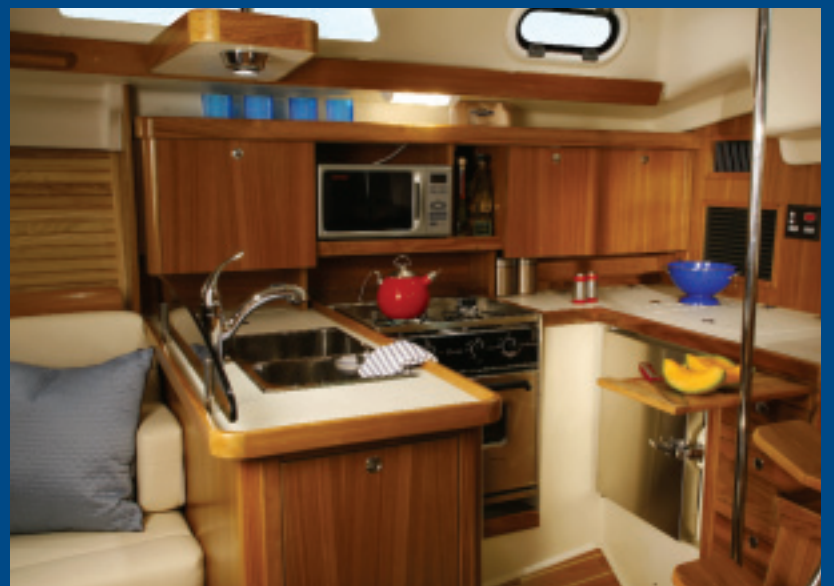
The galley has solid surface countertops, great storage and stainless steel double sink, stove, oven and refrigerator door. It's out of the traffic flow, yet convenient to the cockpit.