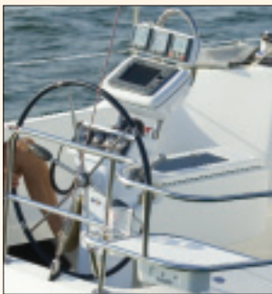
The Edson pedestal steering system with single lever controls is mated to a custom engine panel with complete instrumentation and LED lighting; the polished guard supports Raymarine electronics in Nav-Pod housings.