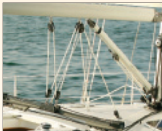
The custom Garhauer traveler can be controlled conveniently from one side; all blocks are ball-bearing and carry Garhauer's 10-year warranty.