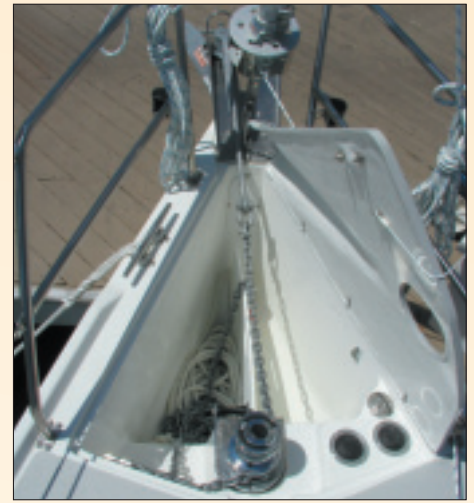
The electric anchor windlass has power up and down switches. There are two bow rollers and a divided locker for two anchors and rodes.