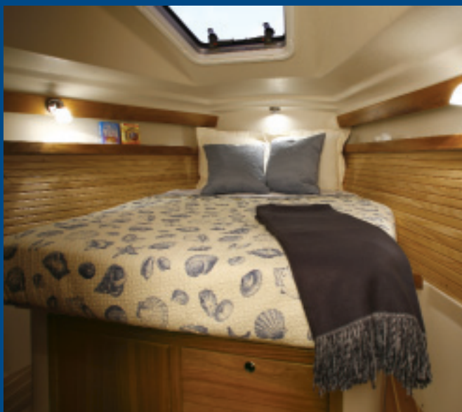
Both the owner's cabin and aft cabin have good lighting, ventilation and quality inner spring mattresses for comfortable nights aboard.

The 350 Mark II incorporates the refinement and improvements only possible by listening to over four hundred and fifty 350 Mark I owners worldwide and learning from their experiences.