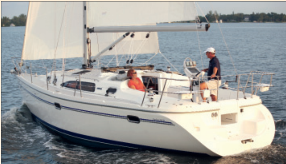
Wide weather decks, double lifelines and effective non-skid surfaces provide security on deck.