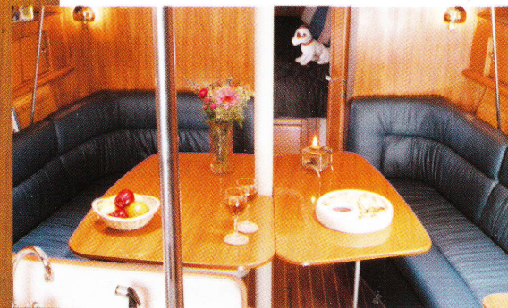
A removable leaf for the dining table is provided, making room for the whole crew at mealtimes.