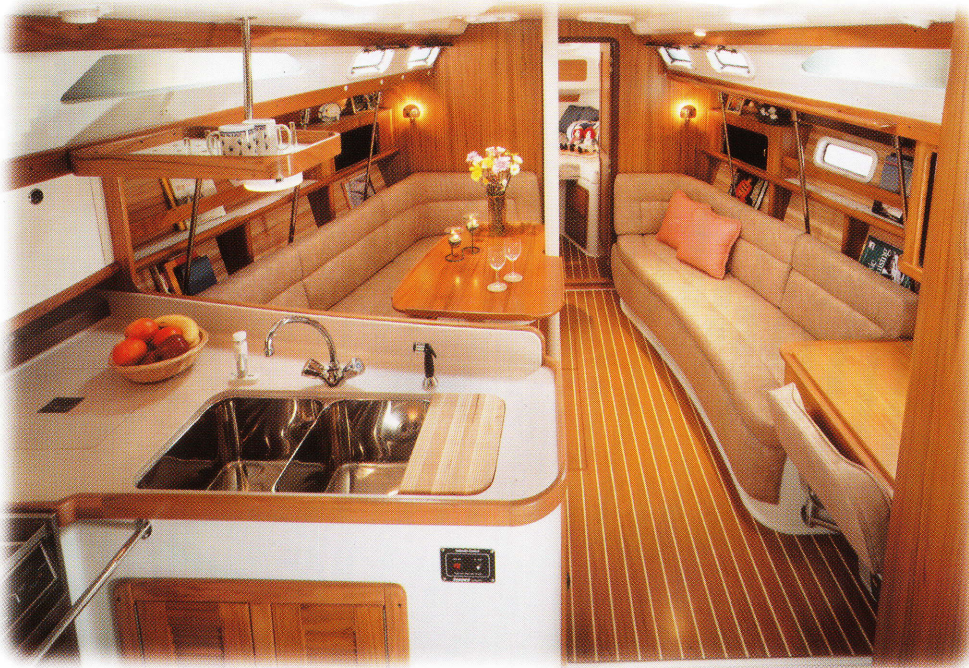
The beautifully appointed salon is finished in varnished teak and ash, complimented with your choice of available upholstery fabrics

T he New Catalina 380 is designed to incorporate the performance, accommodations and features experienced sailors told us are important in their next boat. The ability to listen to boat owners is our most important design tool. All aspects of the 380 from the securely stayed rig, to the choice of deep or shoal draft keels, reflect your sailing lifestyle.