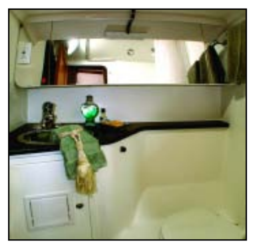
The head aft has two entrances and is located next to the companionway. Fore and aft heads discharge into a common 55 gallon holding tank, for extended range between pump-outs.