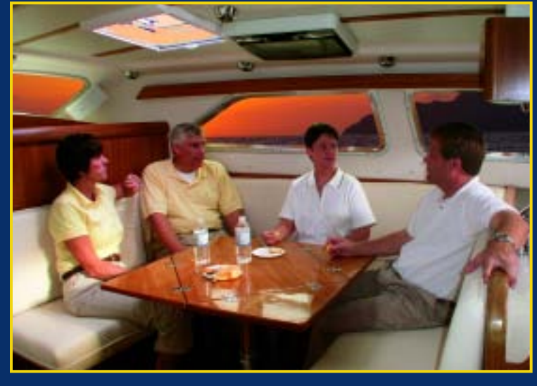
The optional fip-down TV is centrally located on the overhead, above the dinette. In the stored position it won't block the view through the saloon windows.

The salon table will accommodate 6 adults. Area underneath settees at the dinette is open for storage, ideal for canned goods. Table raises and lowers electrically with a switch control to form a double berth, the filler cushion matches the salon upholstery and is standard.