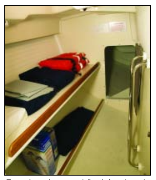
The workroom be accessed directly from the cockpit. Work bench can be used for an optional berth. Shelf below workbench can be extended to make a additional berth, or used for storage as shown.