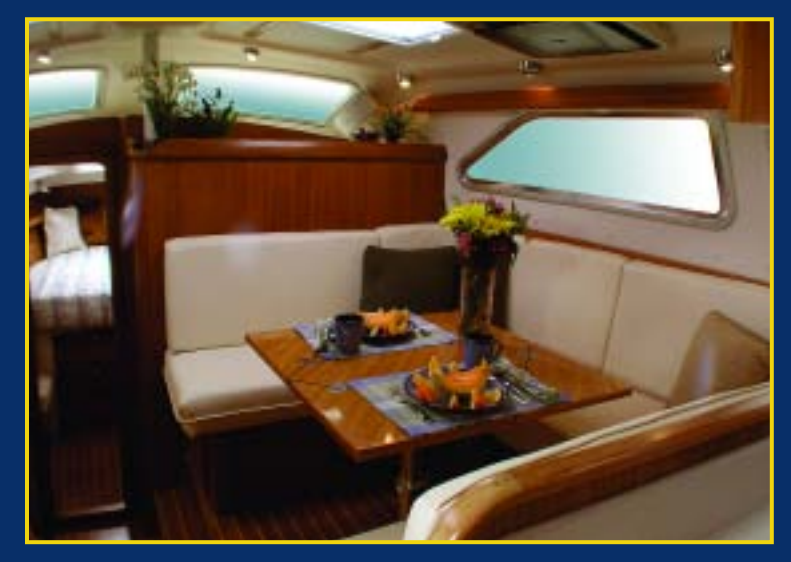
Main cabin table rotates and all four corners fold inboard to form a cocktail table. Three steps from salon floor to cockpit make an easy and safe companionway.

50 Amp AC service and cable TV/phone connections are standard. 30 Amp AC is provided with optional air conditioning.