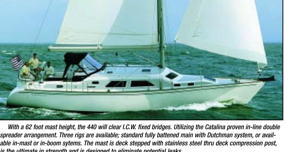
spreader arrangement. Three rigs are available; standard fully battened main with Dutchman system, or available in-mast or in-boom sytems. The mast is deck stepped with stainless steel thru deck compression post, is the ultimate in strength and is designed to eliminate potential leaks.