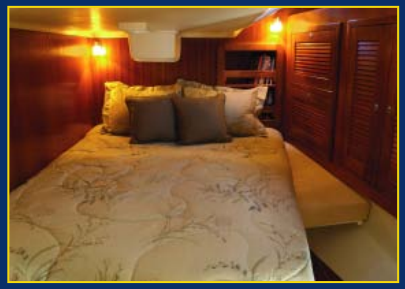
CENTERLINE FORWARD BERTH

Guests will enjoy the inner-spring mattress and private access to the aft head . Three lockers with aromatic cedar lining are provided, along with a book case aft hinges to allow access to the auto-pilot, steering gear, and any other owner installed gear.