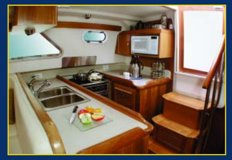
Stairway offers easy access to main cabin with gentle steps and a sturdy banister. Top step houses a large trash can and there are also two storage areas with doors