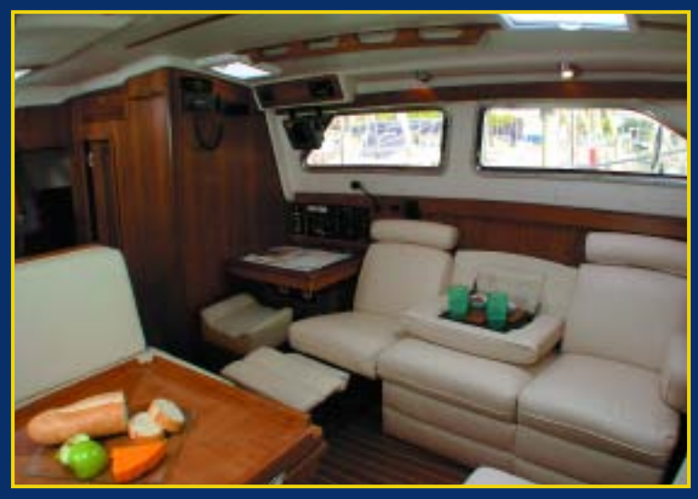
Center backrest to port folds to serve as a cocktail or game table. Both seats have reclining backs and foot rests that raise to become ottomans