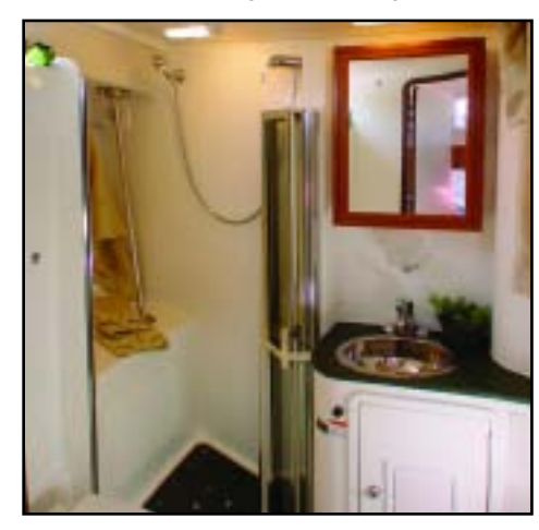
The forward head is private and accessible only through the owners cabin. The spacious shower enclosure has folding panels of tenpered glass. Both heads have a polished stainless steel sink and single lever faucet, along with electric toilet