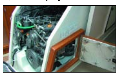
Complete engine access for easy maintenance.