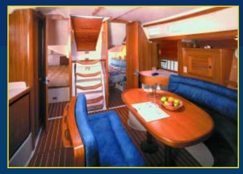
With a second head aft and navigation station to port, both are convenient to the cockpit.

Additional storage is under the massive wrap-around seating and the detached settee.