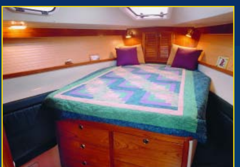
The pullman owners' berth forward features side by side hanging locker and bureau with a seat in between. Additional storage is provided under and on shelves above the 6'5" double berth. The head is forward with enclosed shower compartment.

The centerline owners' berth forward features a pedestal berth, flanked by settees port and starboard. Storage is plentiful with two hanging lockers and five drawers under the bed. There is private access to the forward head from the forward cabin.