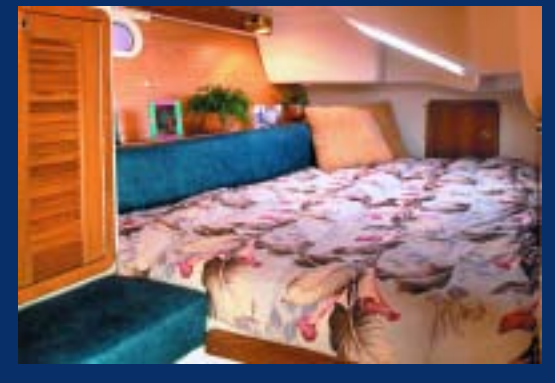
Each aft cabin has a roomy double berth with seat and hanging locker

The three cabin interiors invite friends and crew to gather around a table that seats everyone comfortably. The gourmet side galley with molded counter surface includes the convenience of a combined top loading icebox/refrigerator, with an additional front loading door, finished in teak veneer. Eight drawers and three cabinets, along with counter top storage put all cooking accessories close at hand.