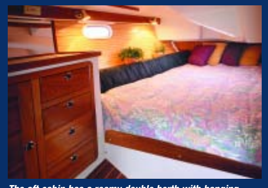
The aft cabin has a roomy double berth with hanging locker and dresser with bureau.

Available Ultraleather™ upholstery offers all the benefits of leather, without the disadvantages. Louvered teak cabinetry in the salon offers functional, out of sight storage possibilities.