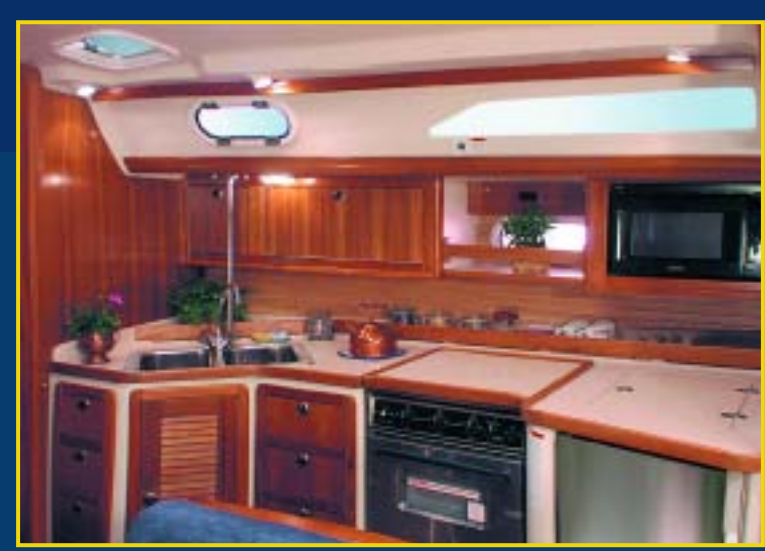
At the center of the galley is the stove, flanked by the sink, refrigerator and microwave, all easily within arm's reach