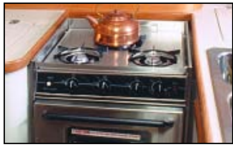
Three burner stainless steel stove with oven standard.