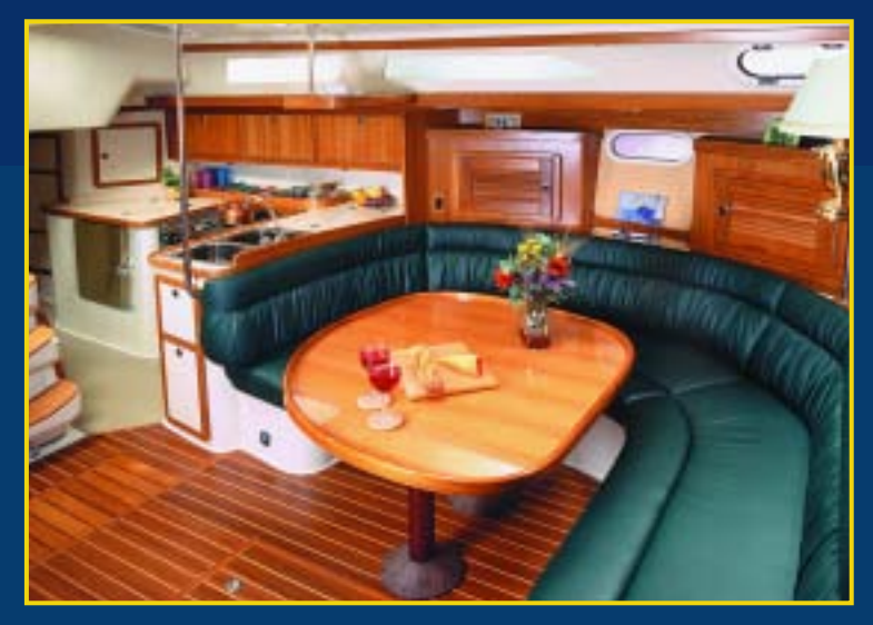
The two cabin salon is a spacious, inviting place to spend time with family and friends after a rewarding day of sailing.