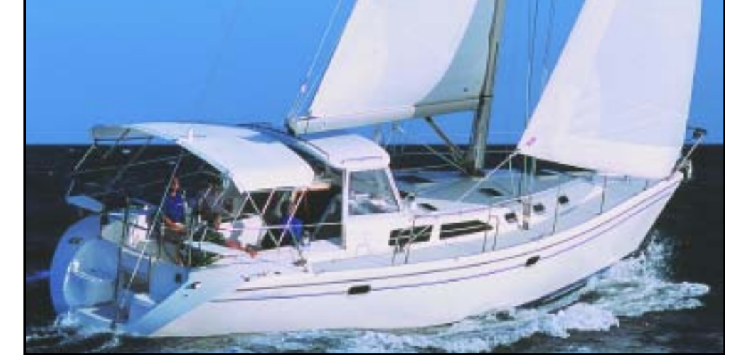
An all-weather fiberglass dodger with handrails is available. All window panels are easily removed, and constructed of a patented glass on plastic material for optical clarity, flexibility and scratch resistance.