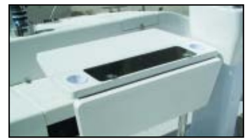
Fiberglass cockpit table with foot brace. Teak leaves and bin lid are available.