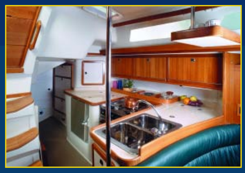
The two cabin galley has 10 cabinets, plus dry storage food storage locker. Top and side loading icebox provides accessible food and beverage storage.