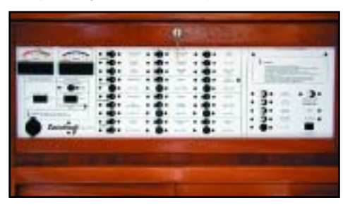
Complete electrical panel with provision for additions and options that may be added later.