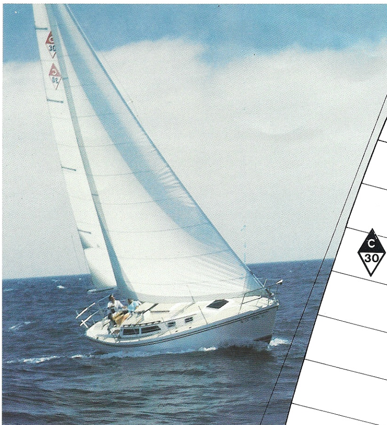
Photo and drawings may show optional equipment. Refer to a current retail price sheet for standard equipment list and specifications.