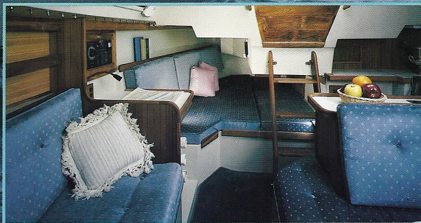
View of the Main cabin looking aft. The aft double berth has a port overhead, for light and ventilation. The navigation desk is handy to the cockpit.