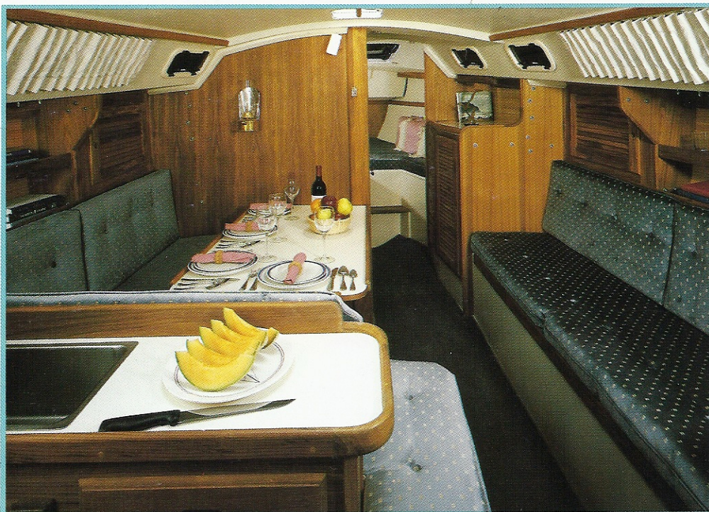
View of Main cabin looking forward. The interior is finished in warm teak and ash. A cushion fabric is available to create your own Catalina 30...

The styling is crisp and modern incorporating recessed windows and genoa tracks, skillfully combined with a traditional low profile cabin, creating a modern classic to assure years of value and enjoyment.