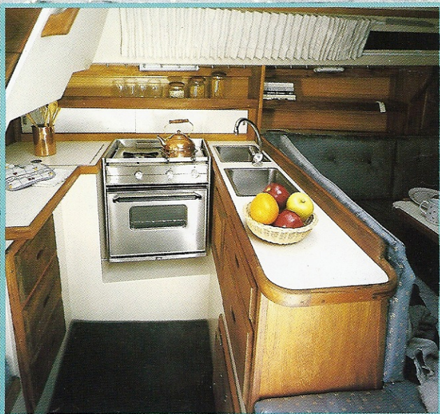
The galley is exceptional for a thirty footer. The stove with oven is gimbaled. The ice box is top loading.