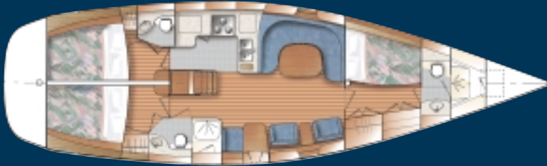
Optional Twin Aft Cabin Interior

All three interior layouts are available with the following options on the Starboard side of the Main Cabin: