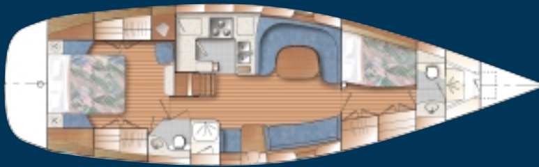
Standard Two-Stateroom Interior