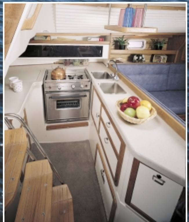
The custom molded sandstone galley countertops highlight the increased counter space that encloses additional cabinets and utensil bin. The handy new overhead storage rack adjusts to accommodate many sizes of dishes, cups and glasses.