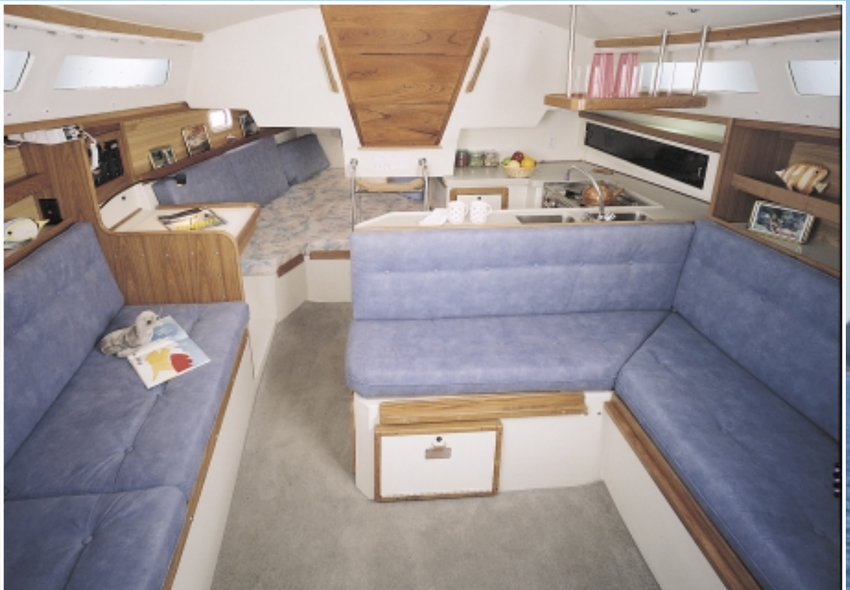
The varnished teak main cabin table is removable for entertaining. Your choice of the traditional "L" shaped settee or a "U" shaped dinette with pedestal table are available.